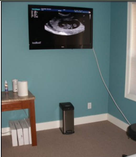
Inside InnerVision’s ultrasound room allows clients to see the image of their baby moving in utero on a large flat screen.

“They deserve all the information that helps them make better decisions. The more information they have, the