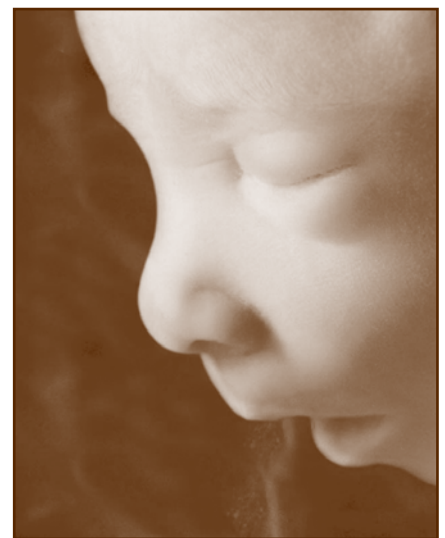
Medical personnel could be forced to kill an infant in the womb such as this one. (Picture: 4 months in womb)

Obama started the process of repealing the Bush enforcement regulation on February 27. When this process is complete, the Conscience Clause from the 1970s will still be in place, but without the enforcement to protect pro-life medical personnel from discrimination and persecution.