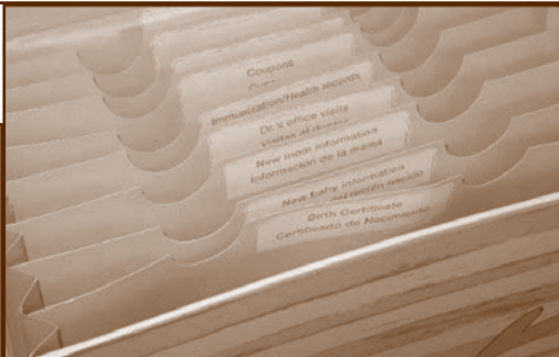
Inside the Organizers are files for safe-keeping of records, appointments and more.

Unintended pregnancies are often happy accidents that fulfill the lives of their parents—or their adoptive parents. Children are good for Iowa's economy.