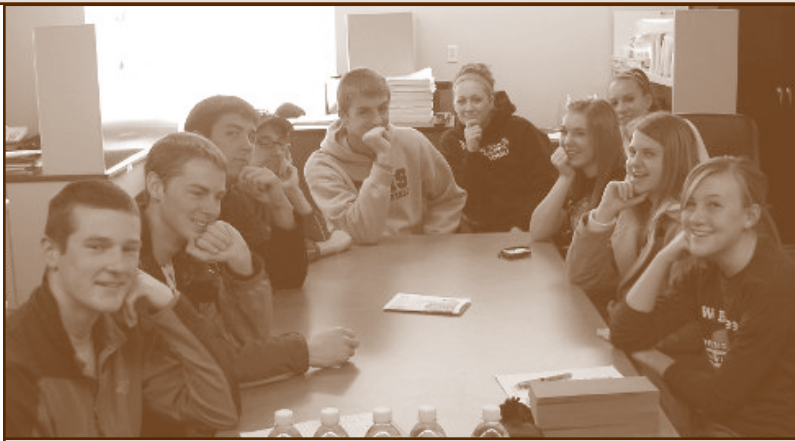
Think Tank: Pro-life students take part in a pro-life brainstorming session as part of a Service Day at Iowa Right to Life

Grassley, plus the five U.S. Representatives from Iowa. These postcards are still available for individuals and groups.