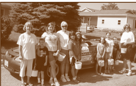
Above: Raccoon Valley RTL lines up for the 4th of July Parade in Panora. Right: Muscatine Right to Life on parade in Muscatine's 4th of July Parade.